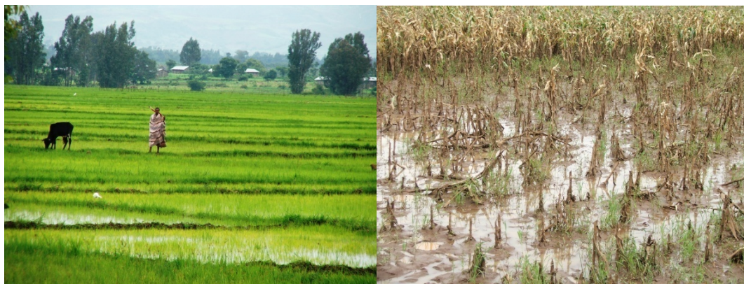
Plate 1: a) Rice grown on the Fogera plains b) waterlogged maize